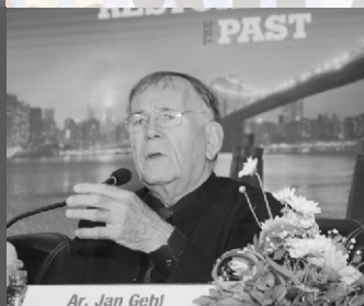
Ar. Jan Gehl

33,450+ Visitors 220+ Exhibitors 25 Participating Countries 80+ Event Speakers