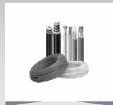
WIRES & CABLES