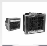
DIGITAL PANEL METERS