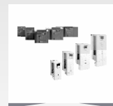
SWITCHGEAR & AUTOMATION COM.