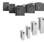
Switchgear, & Drives